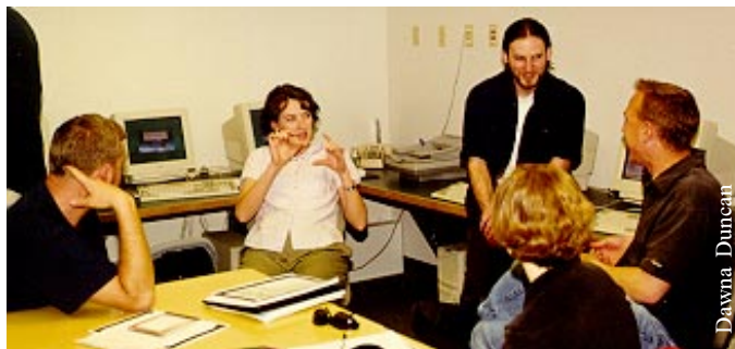
A group of CD students discuss the program revision