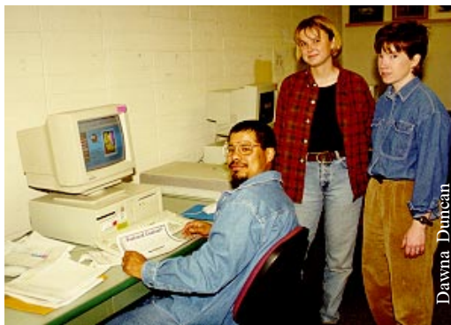
The staff of the Nieva Roja Review.

In the meantime, not that there's much of that to go around, we're working towards adding to both our submission volume and our staff. To do this we need everyone's support. Too many of university on-line publications die after their creators graduate and leave. We want to make certain that isn't the fate of the Nieva Roja Review . The magazine provides a great opportunity for graduate students to get both publishing experience as well as technical expertise in publishing as well as web-page coding and design. It also